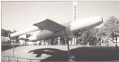
Mockup of a German WWII V1 Rocket in Huntsville, Alabama.

Open Air Incinerations in Auschwitz: Rumor or Reality?, pp. 3-17